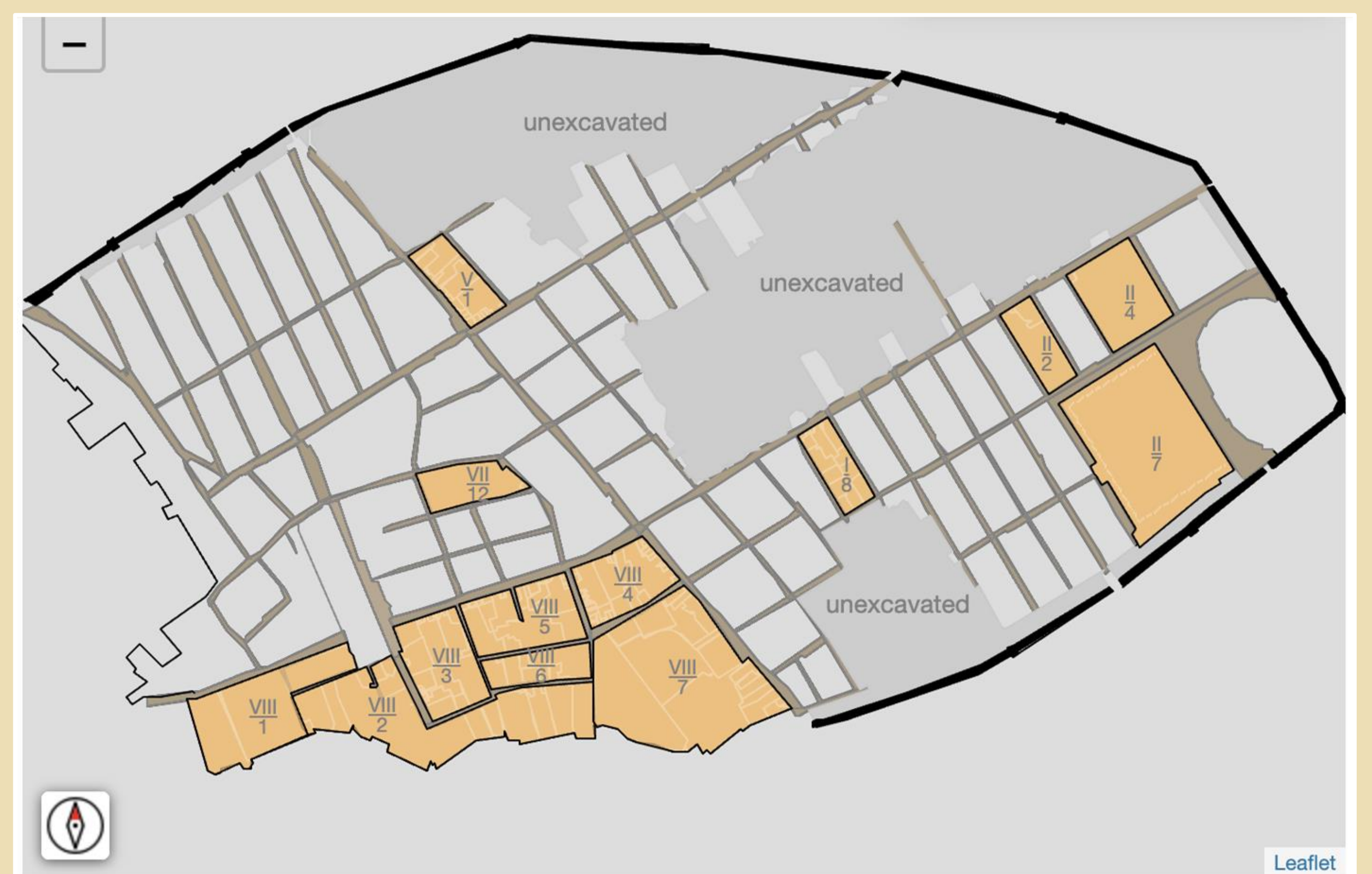
Map of Pompeii (at ancientgraffiti.org ) illustrating areas where inscriptions have been comprehensively edited and are available in EDR.

Benefiel and Sypniewski, Italia Epigrafica Digitale 2020 Benefiel et al., Italia Epigrafica Digitale 2017 http://ancientgraffiti.org (The Ancient Graffiti Project)